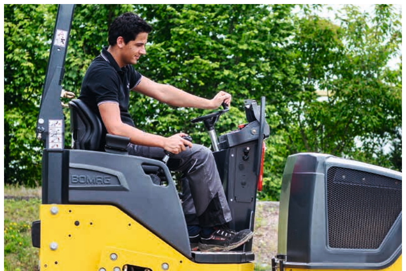
Ample leg room for the operator ensures a comfortable working environment.

The response of the control lever is very pleasant; reversing is modulated and very precise. Drum vibration can be activated selectively for the front or rear only, or for both drums. In tandem with the IVC (Intelligent Vibration Control) system, the exciter system guarantees consistent compaction and reliable operation at all times.