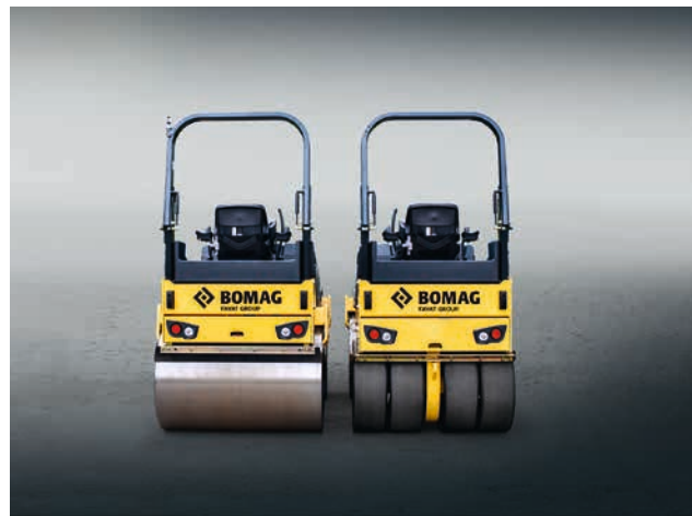
BW 135/138: The heavyweights from 3.9 to 4.3 t.