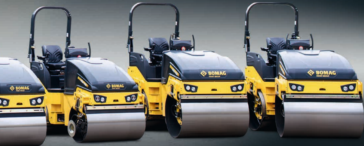
BW 100 AD-5