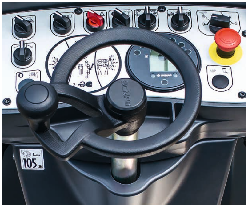
Large switches, a compact steering wheel and clearly arranged controls make it easy for any operator to work with a light BOMAG tandem roller.

Every function is self-explanatory and intuitive to operate after a very short time. As with every BOMAG tandem roller, the main functions can be selected precisely and error-free by the ergonomic control lever.