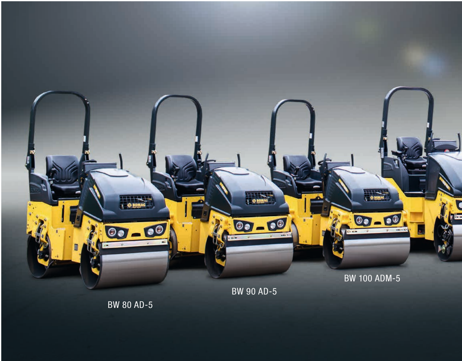
BW 80 AD-5