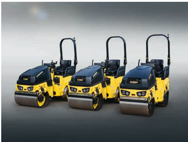
BW 80/90/100: The light line up to 1.8 t.